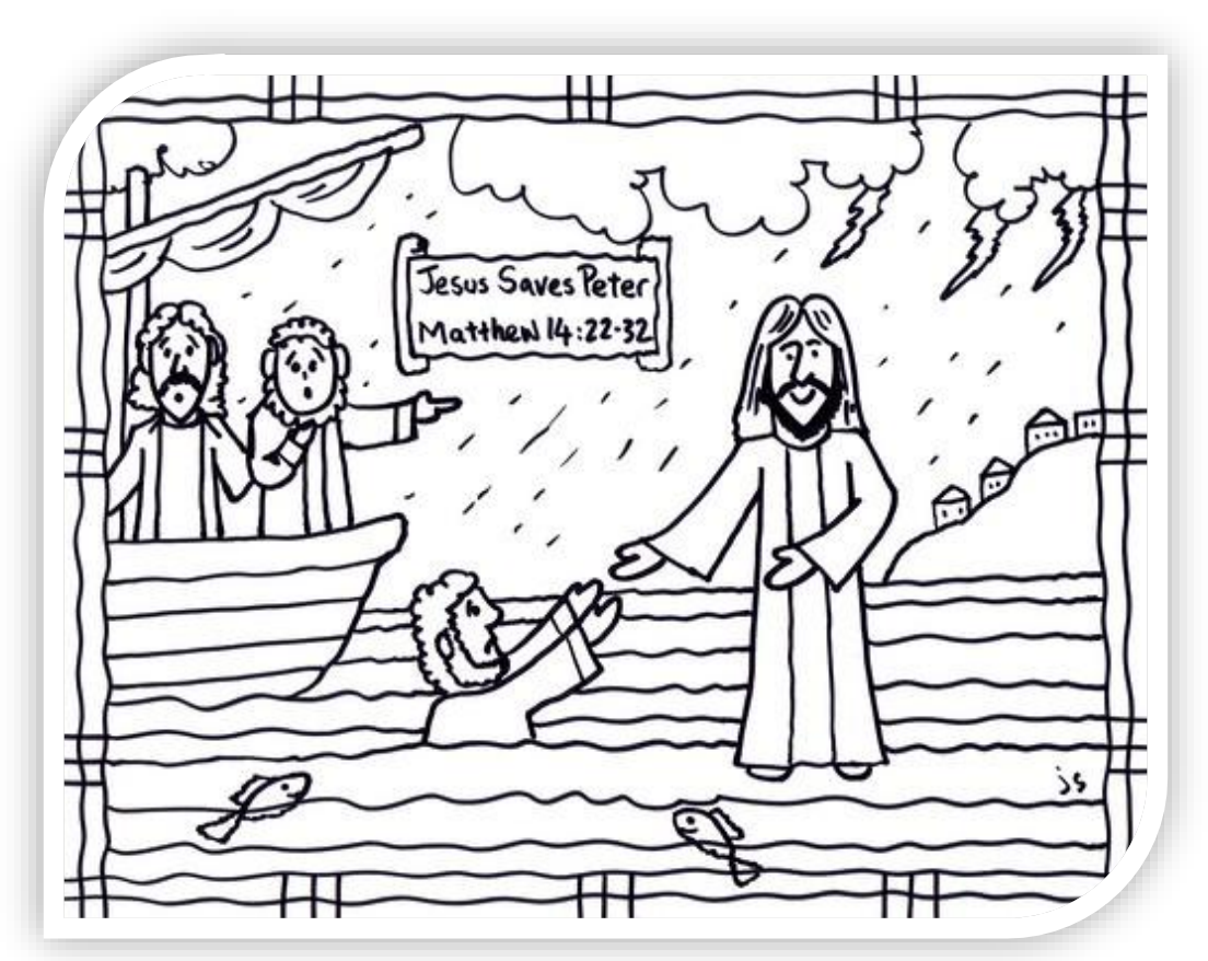
DRAW YOURSELF WALKING TOWARDS JESUS