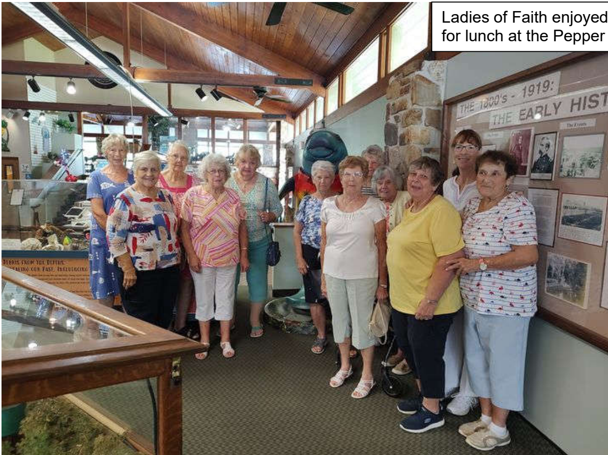
Ladies of Faith enjoyed a day out for lunch at the Pepper Creek Grill.

Live streaming of our worship services, newsletter and weekly updates may be found at our church web site. Go to http://www.faithlecanto.com/ .